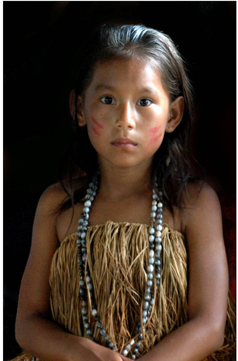
available as a postcard and poster for individual order. Please contact clannoye@dzs.org for more information if you are interested.